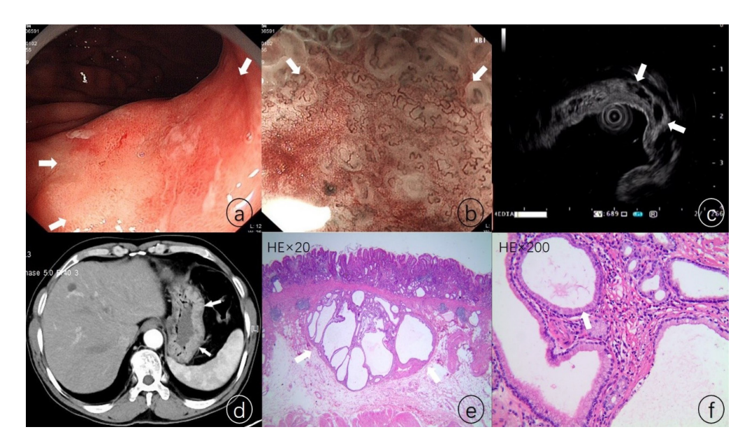
Figure 1. Endoscopy imaging and pathological features of early gastric cancer with GCP. a) Gastroscopy revealed a flat lesion with a reddish depressed area in the posterior wall of the cardia (indicated by the arrows); b) Magnified NBI observation revealed clear a demarcation line, disordered microvascular pattern, and different type micro-surface pattern (indicated by the arrows); c) Endoscopic ultrasonography (UM-2R) revealed a heterogeneous submucosal mass with internal cystic space (indicated by the arrows) d) CT imaging revealed slightly thickened cardiac wall (indicated by the arrows); e) Low power view of the H&E staining (H&E \times 20) revealed cystically dilated gastric glands without dysplastic changes into the submucosa (indicated by the arrows); f) High power view of the H&E staining (H&E \times 200) showed gastritis cystica profunda (indicated by the arrows).